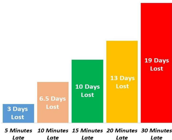
Over one academic year

Arrivals between 9am and 9.15am will be recorded as 'late'. Arrivals after 9.15 will be recorded as 'unauthorised absence' for the morning session.